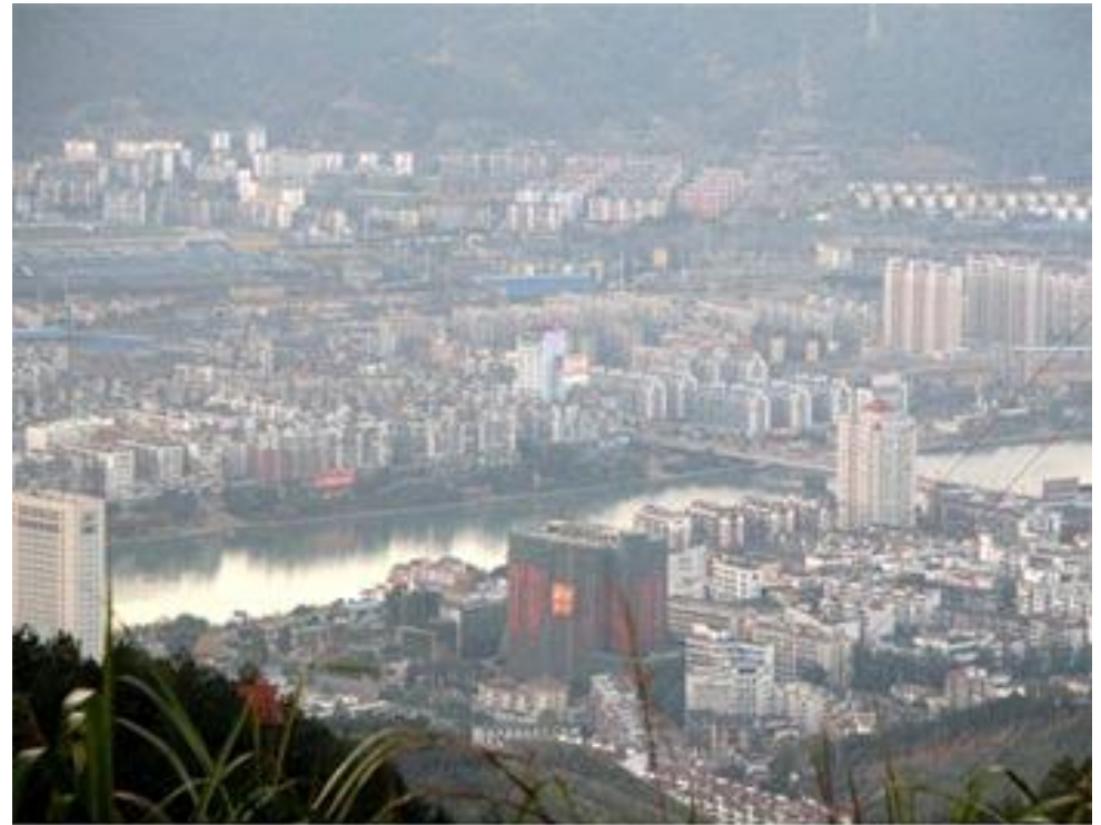
San Ming overlooking Liedong

Will you join me in telling Christ's story to the WORLD?